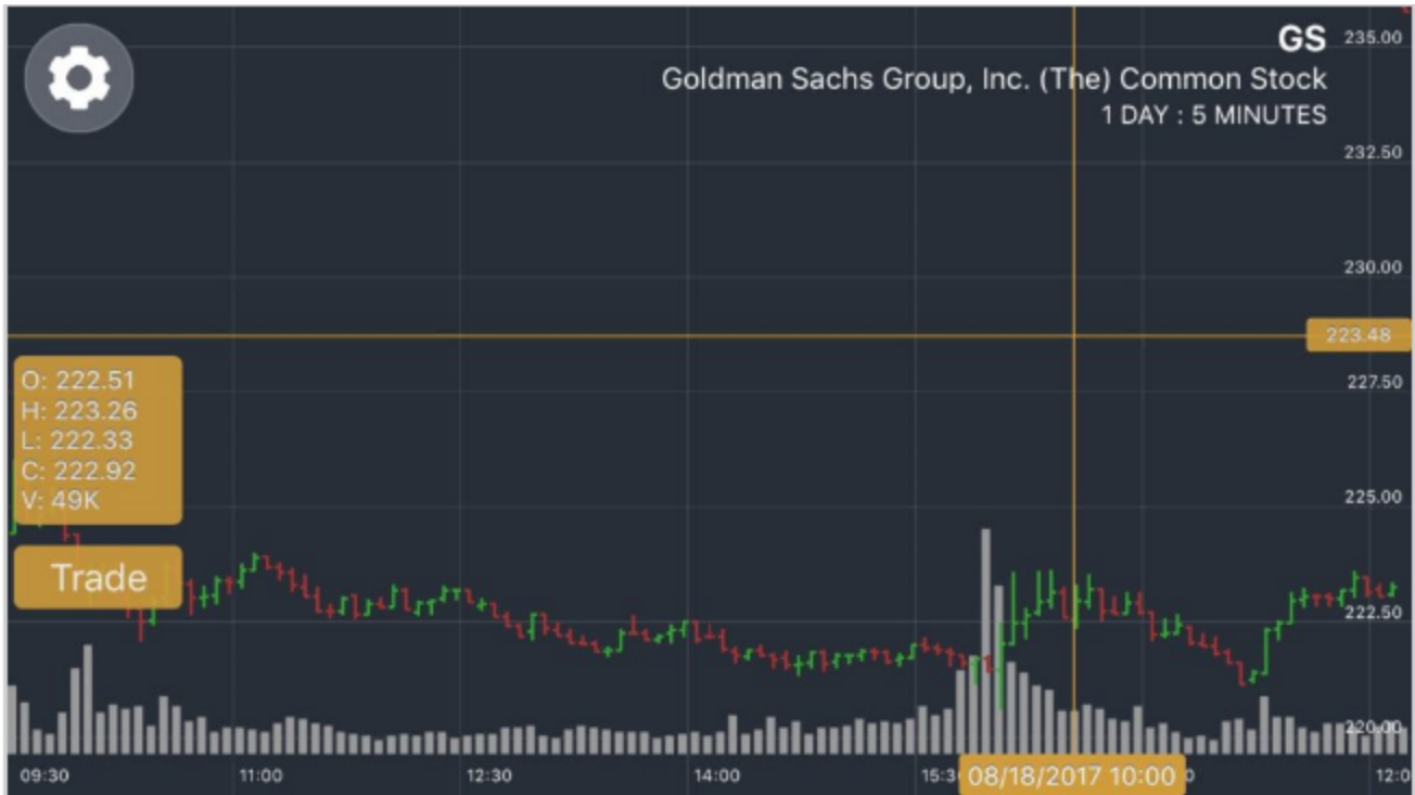
Trade from Chart in Full View Mode